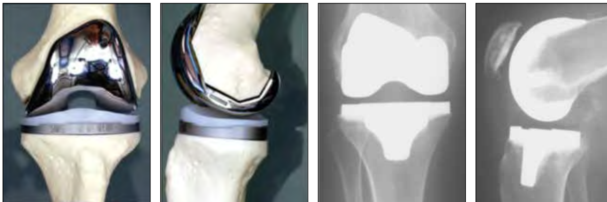
The standard total knee in a plastic model is shown on the left, and X-rays of the knee following surgery are shown on the right.

During knee replacement surgery, a metal prosthesis that resembles the normal shape of the femur in the knee joint is placed over the end of the bone. The top of the tibia is replaced with a metal plate with a small stem that reaches down into the bone. The femoral component articulates with a specially shaped polyethylene tibial insert that attaches to the tibial plate. All of these components are inside the joint with preservation of the normal capsule and major stabilizing ligaments on the sides of the knees. Generally, the undersurface of the kneecap, or patella, also is resurfaced with a polyethylene implant. These components are fixed with cement or bone ingrowth into porous surfaces.